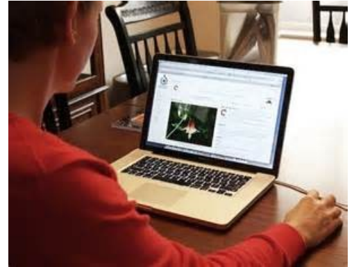
Read your newsletter online Save ACC printing and postage costs

Want this newsletter via EMAIL ONLY? Please send an email to acc@ccsww.org with the word NEWSLETTER in the subject line.